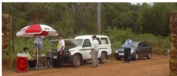
Een van die stasies by laasjaar se Great North Rally