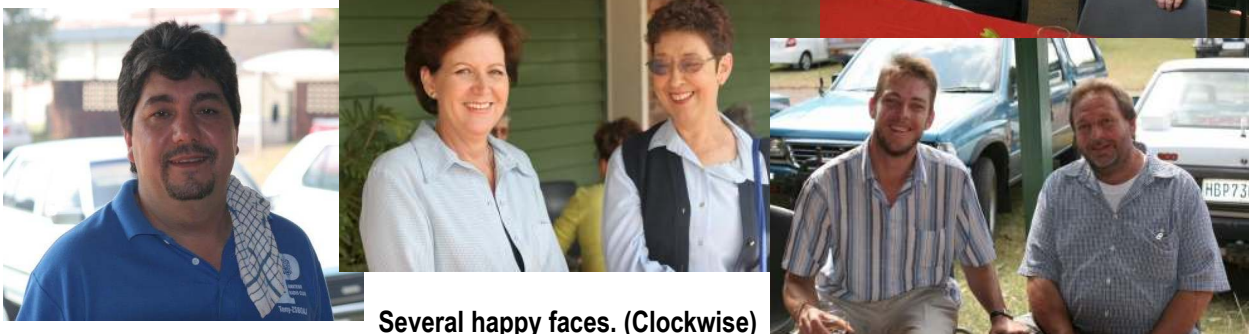
Several happy faces. (Clockwise)